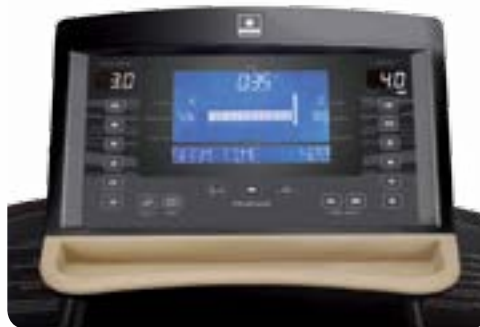
LCD Console with 2 white LED windows.